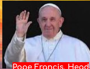
Pope Francis, Head of Catholic Church