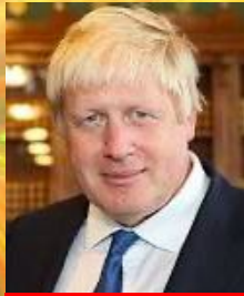
Boris Johnson, UK Prime Minister