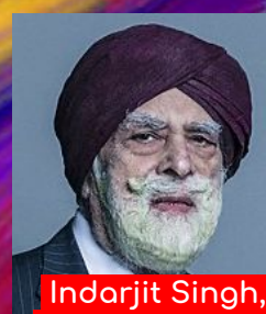
Indarjit Singh, leading UK Sikh