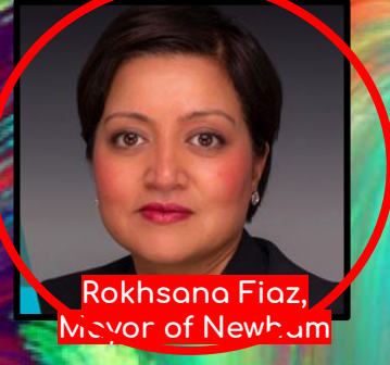
Rokhsana Fiaz, Mayor of Newham