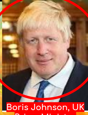
Boris Johnson, UK Prime Minister