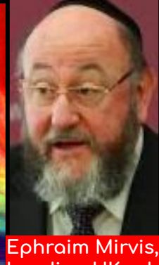
Ephraim Mirvis, Leading UK rabbi