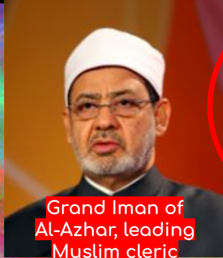
Grand Iman of Al-Azhar, leading Muslim cleric