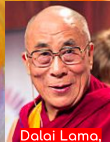
Dalai Lama, Buddhist Leader