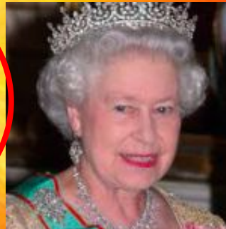
Queen Elizabeth II, Head of Church of England