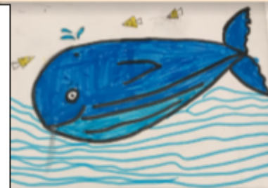
Whales live in the sea

We read Dear Greenpeace so Hana drew a wonderful whale.