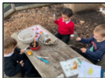
Stone and stick - Elizah