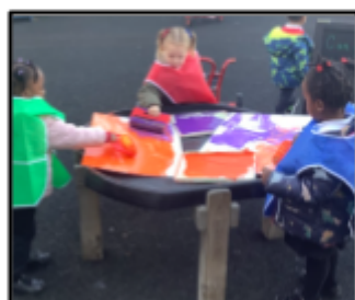
Jelly - Elena