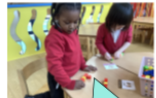
Look at my pattern: bubble bubble pop!

Well done to all of the Reception children for their amazing efforts with behaviour and attitudes towards learning. This week, our happy leaves go out to: