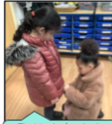
First I asked my brain and then my buddy when I needed help!