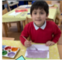
Mark Rothko painting!