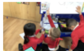
The whiteboard is too tall. We need two rulers.