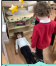
I'm measuring using my feet!