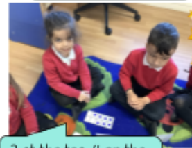
2 at the top, 4 on the bottom make 6!

Well done to all of the Reception children for their amazing efforts with behaviour and attitudes towards learning. This week, our self-confidence & trust happy leaves go out to: