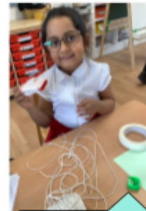
I love coming to school!