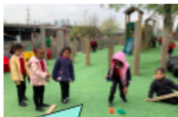
We are playing a counting game!