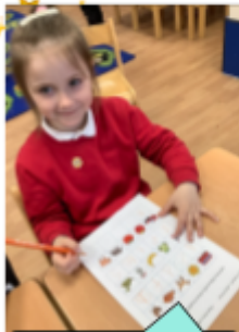
I am learning English!