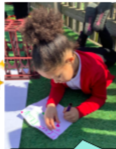
I am writing a note for my mum!