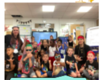
(We love Rockstar Day!)