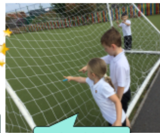
Look! A rhombus!