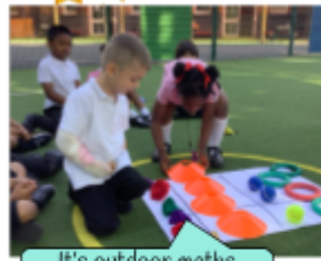
It's outdoor maths week!