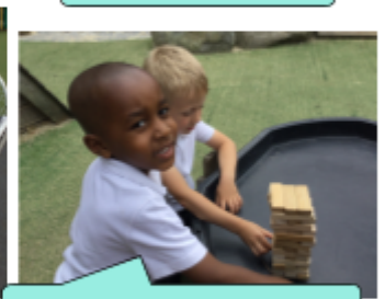
Playing Jenga with my friend!

Well done to all of the Reception children for their amazing efforts with behaviour and attitudes towards learning. This week, our Support happy leaves go out to: