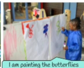
I am painting the butterflies in our classroom!