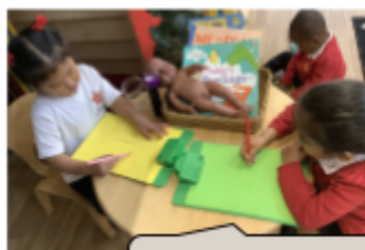
We are at work.