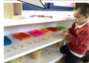
1, 2, 3, 4, 5, 6, 7, 8, 9, 10!