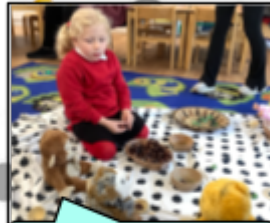
A teddy bear's picnic!