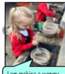
I am making a yummy soup for my mummy.