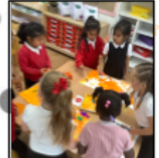
I am making an orange painting. Look!